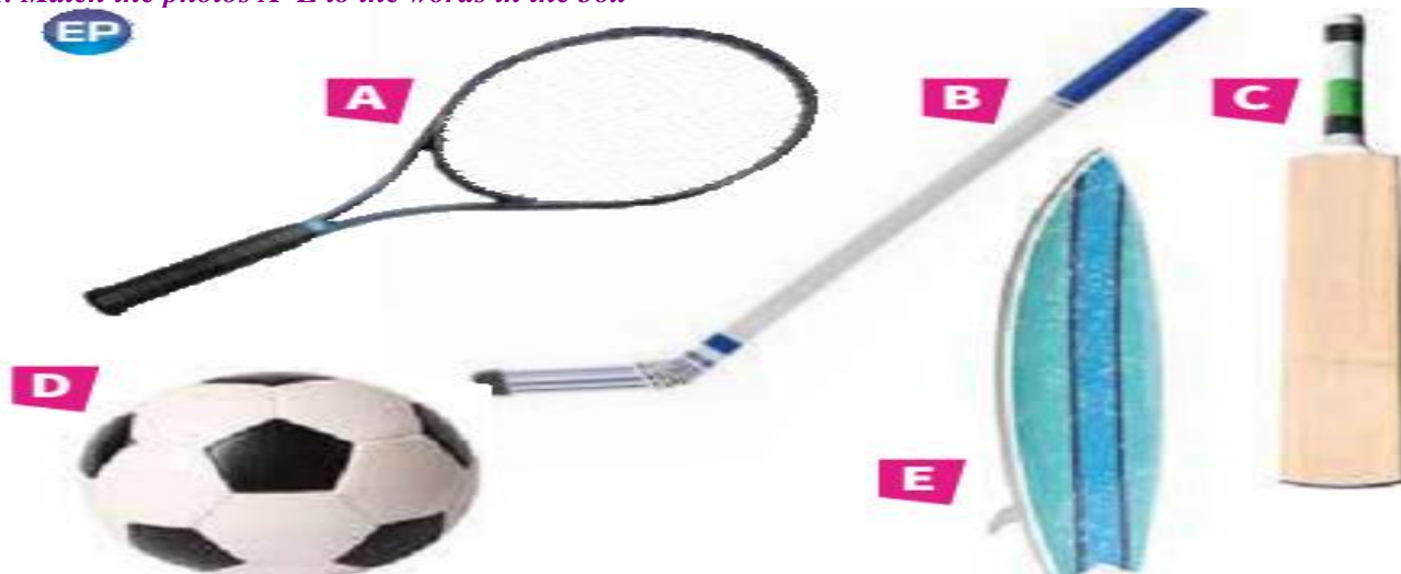
bat ball board racket stick