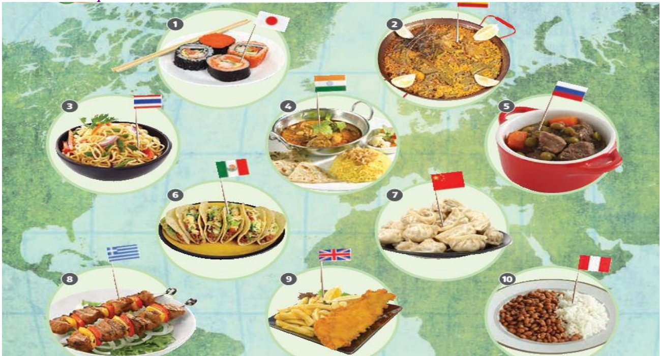
a curry b dumplings c fish and chips d kebabs e noodles f paella g rice and beans h stew i sushi j tacos