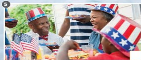
Independence Day, New York

15. Listen again and say the missing words.