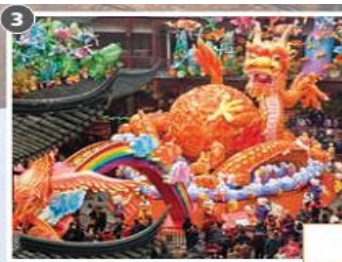
New Year, Shanghai