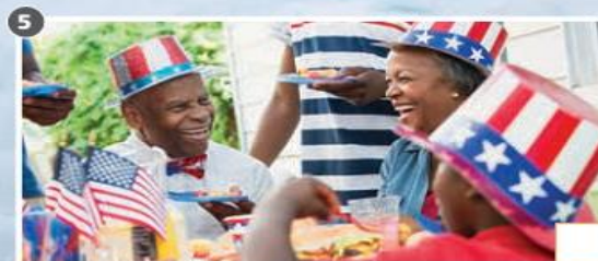
Independence Day, New York

15. Listen again and say the missing words.