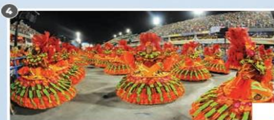
Carnival, Rio de Janeiro