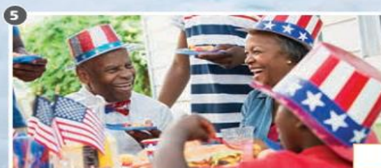
Independence Day, New York

15. Listen again and say the missing words.