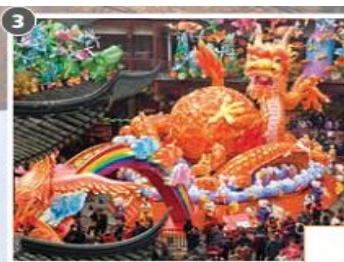
New Year, Shanghai