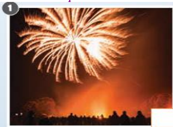
Bonfire Night, Lewes

a Brazil b China c Spain d the United Kingdom e the United States