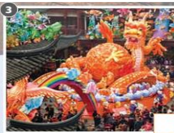
New Year, Shanghai