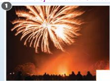
Bonfire Night, Lewes

a Brazil b China c Spain d the United Kingdom e the United States