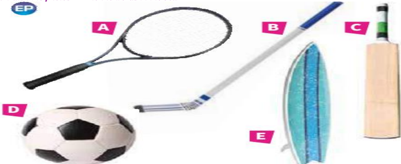
bat ball board racket stick