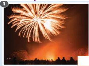
Bonfire Night, Lewes

a Brazil b China c Spain d the United Kingdom e the United States