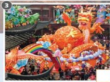
New Year, Shanghai