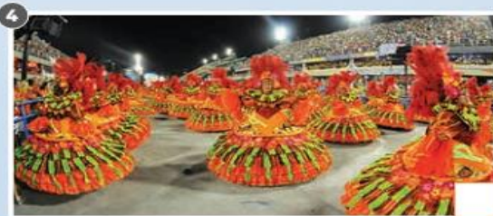
Carnival, Rio de Janeiro