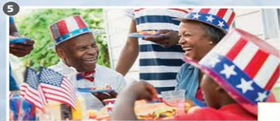
Independence Day, New York