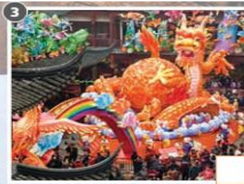
New Year, Shanghai