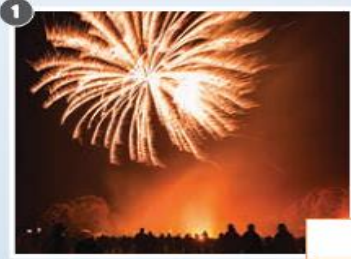
Bonfire Night, Lewes

a Brazil b China c Spain d the United Kingdom e the United States