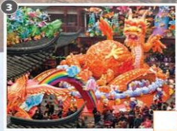
New Year, Shanghai