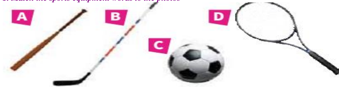
ball bat racket stick

Now match the equipment to these sports.