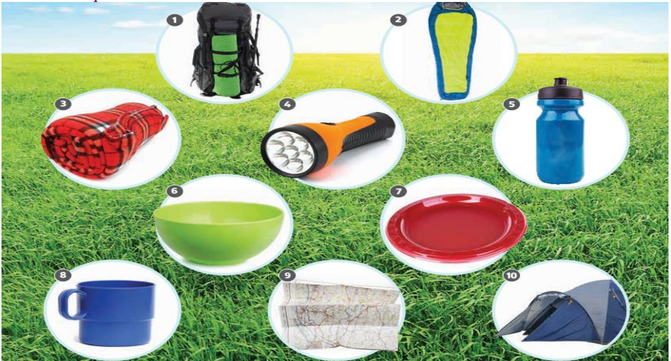
a blanket b bowl c cup d map e plate f backpack g sleeping bag h tent i flashlight j water bottle