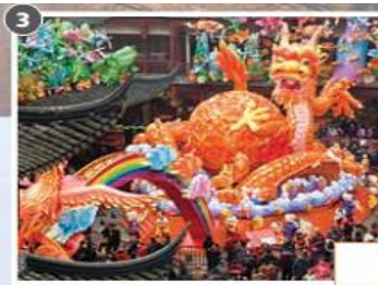
New Year, Shanghai